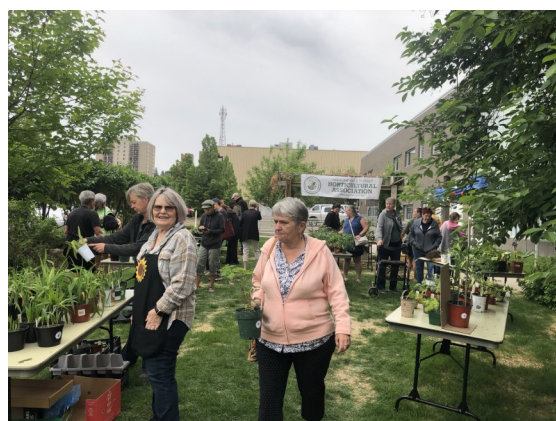
MHDHA plant sale