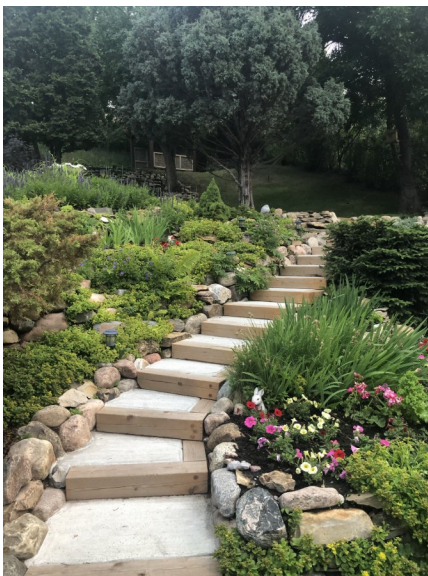
MHDHA flower bed